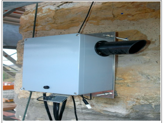
Pic 1: Dimetix Sensor installed at the historic buiding "Blauer Turm" in Germany.

Geodetic permanent monitoring of historic buildings are to support redevelopment concepts. Historical buildings, including church buildings, are part of the cultural and social property, whose conservation is not only in the interests of the owners, but also in the public interest through the ordinance on the protection of monuments.